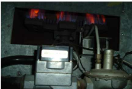
Rusted and corroded gas burners.

Although the system was operable at the time of inspection, replacing the system will significantly improve energy savings.